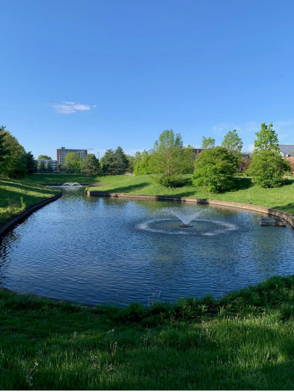
Dorner Retention Basin South View