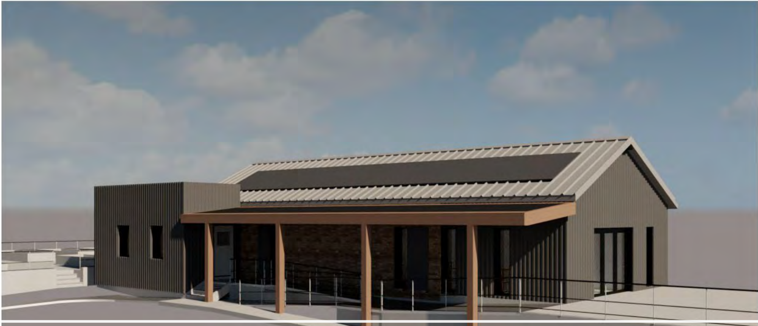
City of Champaign Township-PG Head Quarters